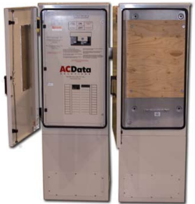
Shown with Optional Base Pedestals

ACData Solutions is dedicated to customers who care about quality and durability. Each PPC we ship is manufactured to the highest possible quality standards and built to accommodate accessibility and technician safety.