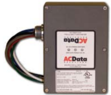
ACData Solutions AC2100-F-07